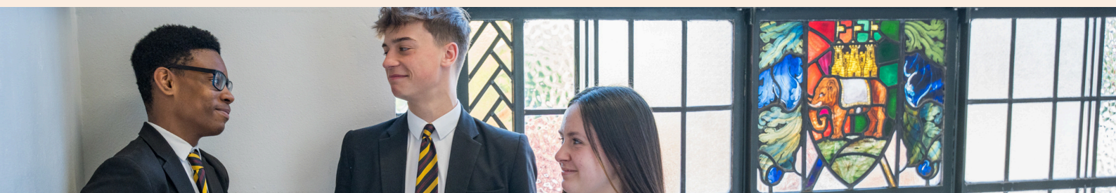
YEAR 9 TEAM: